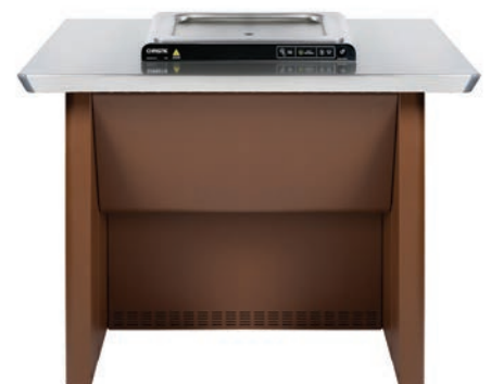
Weathered Steel powder coat

Off-the-shelf finishes: #4 Brushed stainless steel; Dulux Monument powder coat, or Weathered Steel powder coat. Click here to view more standard powder coating colour options (lead times apply).