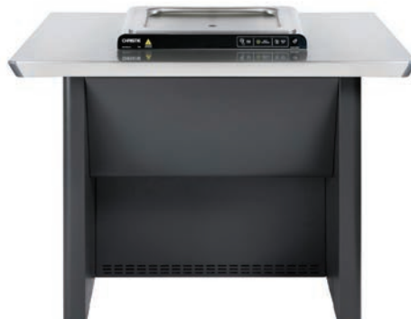
Monument powder coat