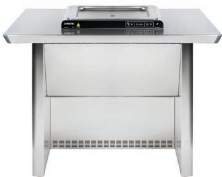
Brushed stainless steel