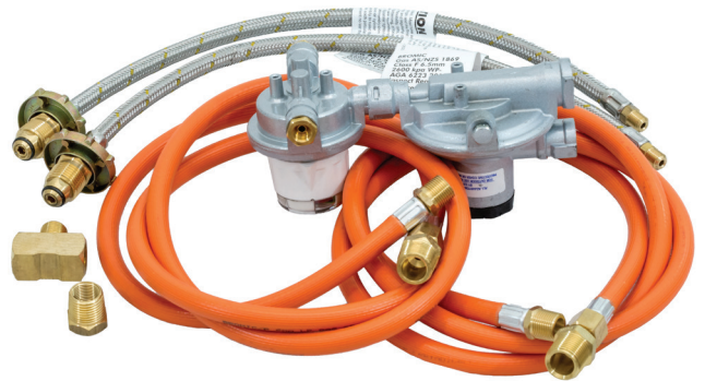
Kit for 2 x cooktops

Christie gas appliances can be specified for operation with reticulated natural gas (NG) or liquid petroleum gas (LPG) supplied via gas cylinders. When LPG is selected, the Auto Changeover Gas regulator is necessary to provide the correct nominal supply pressure to the cooktop. It can also be connected to one or two cooktops.